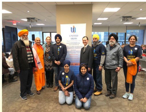
At the Interfaith Harmony event, all food and fellowship reception was sponsored by the United Sikh.