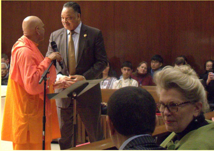
Rev. Jesse L. Jackson Sr