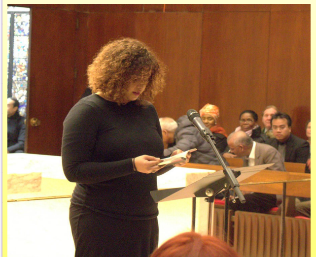
Rosleny Ubiñas National Spiritual Assembly of the Baha'is of the United States

We vow to help all sentient beings. We vow to eliminate all delusions. We vow to learn infinite teachings. We vow to attain supreme enlightenment.