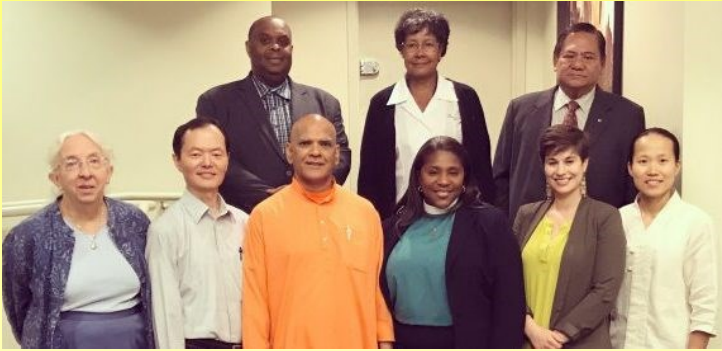
Committee of Religious NGOs at the United Nations Bureau Members